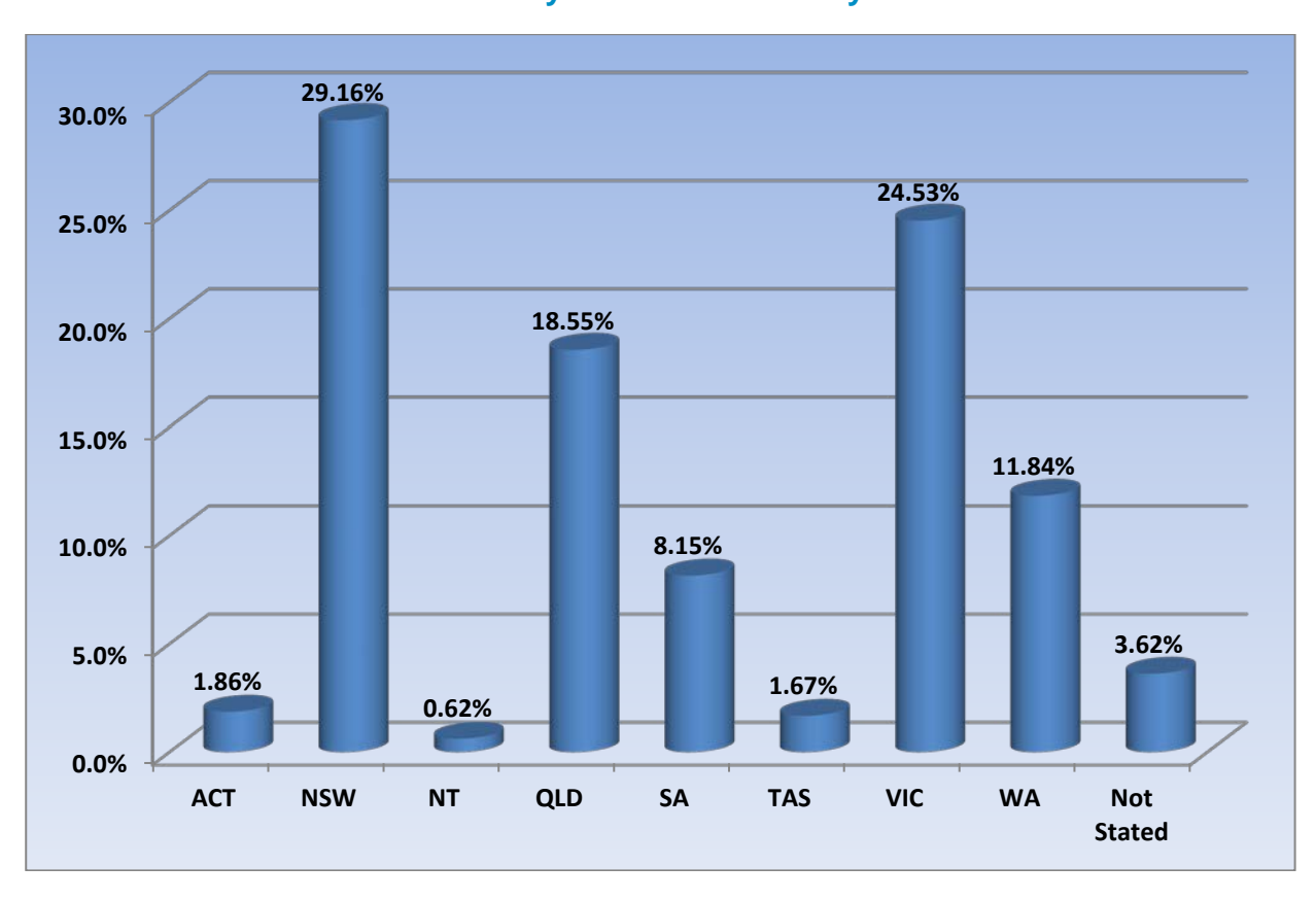
% By State and Territory